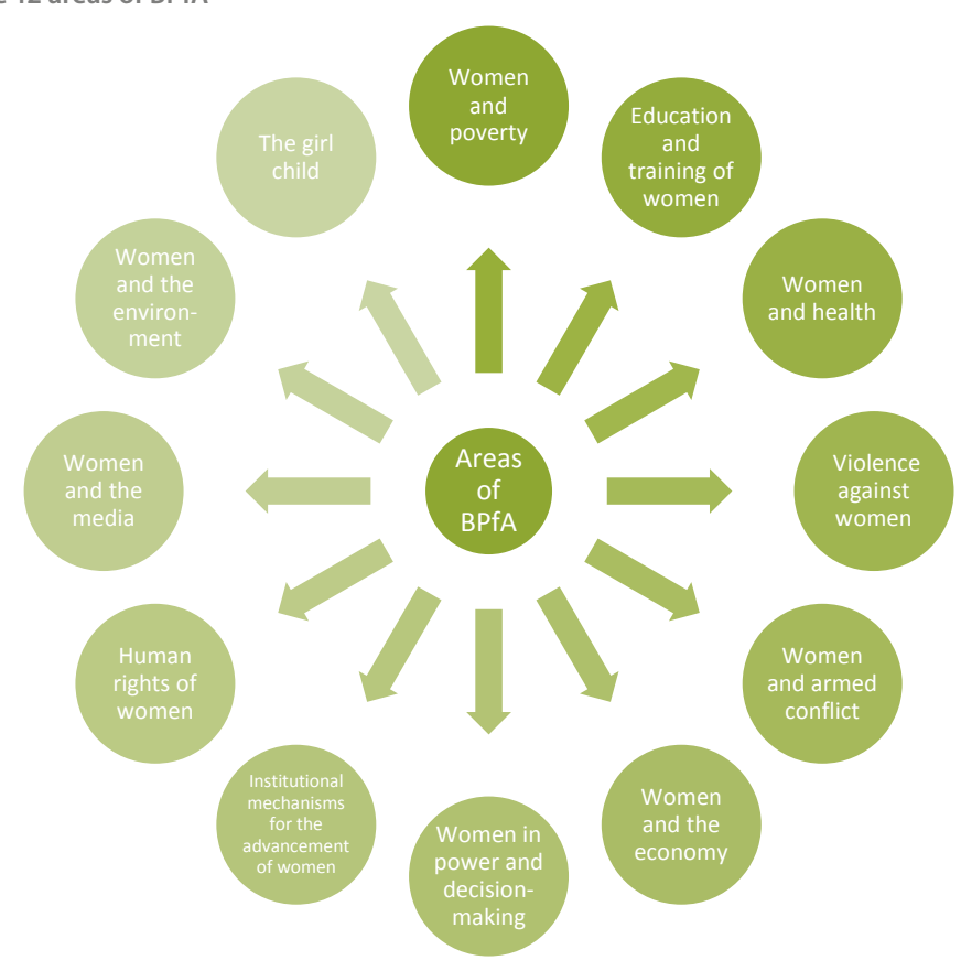
The 12 areas of BPfA

its success depends greatly on the commitment and mobilisation of governments and institutions at all levels.