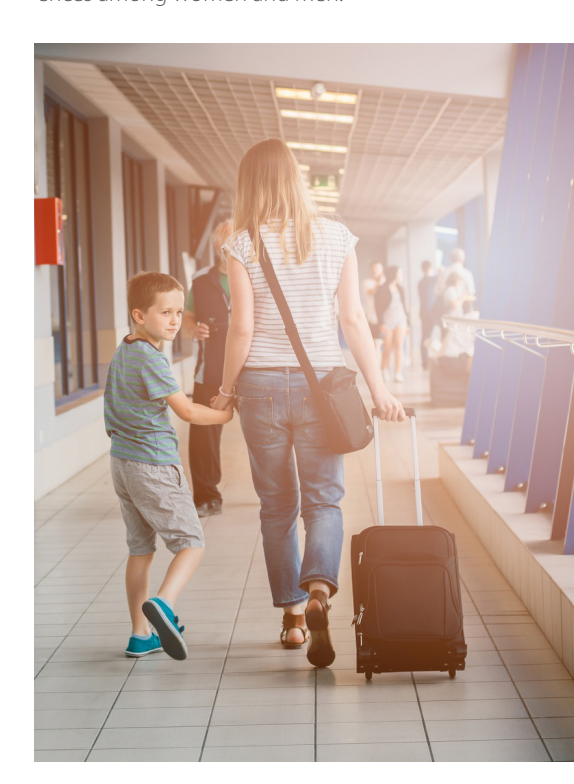
The Poverty report presents data on challenges that lone parents are facing

Poverty is a complex and multidimensional phenomenon and cannot be fully understood without including a gender perspective. Women across the EU are at a higher risk of poverty, primarily due to gender inequalities in the labour market experienced during the life course. EIGE's report explores the progress between 2007 and 2014 in alleviating poverty in the European Union. The intersectional perspective of the report reveals the numerous facets of poverty and the factors that exacerbate vulnerabilities and differences among women and men.