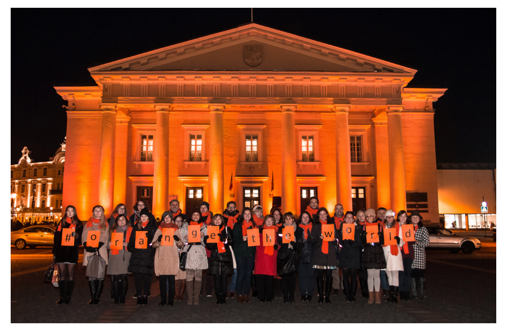
EIGE's team campaigning against violence against women