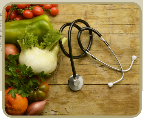
EIGE's Gender Mainstreaming Platform presents gender inequalities in different policy areas.

market participation; wage gaps and time use and fertility.